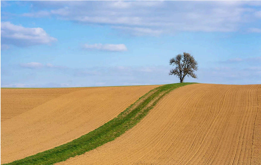
Photo 1: Neudenau , Germany, district Herbolzheim : sloping up bare fields, a track with green grass and a lonely pear tree near the Hohe Strasse southeast of Herbolzheim.

Donec tristique risus libero. Pellentesque lacinia ut orci non ornare. Etiam dapibus dui ut magna pellentesque consequat. In quam nisl, blandit in interdum ut, faucibus a quam. Orci varius natoque penatibus et magnis dis parturient montes, nascetur ridiculus mus. Donec aliquam scelerisque erat quis egestas. Cras pharetra imperdiet sodales. Sed rutrum ipsum aliquam nibh viverra ornare. Aliquam id nulla nec est lacinia malesuada id nec risus. Etiam aliquam ante hendrerit urna tincidunt eleifend. Aliquam erat volutpat. Donec consectetur sodales libero ac porta.