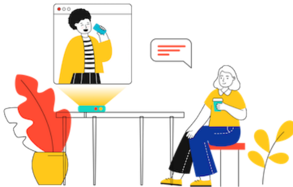
Image: blush.design All Illustrations published on Blush can be used for free. Licence.

Maecenas imperdiet tempus felis sed hendrerit. Etiam ornare placerat augue sit amet sollicitudin. Cras a posuere nibh. Aliquam lobortis imperdiet magna. Curabitur fermentum lacinia consectetur.